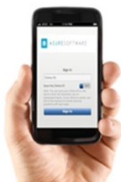
Asure Wealthcare Mobile App

https://asuresoftware.wealthcareportal.com/